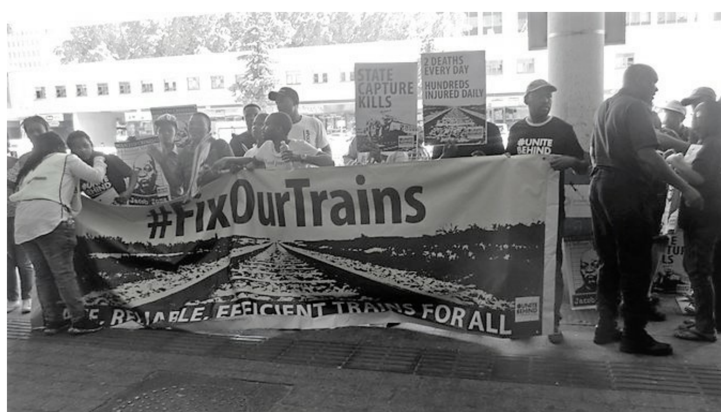
Above: Earlier this year #UniteBehind protesters entered a PRASA meeting in Cape Town, calling for the dismissal of top management

The EELC is representing #UniteBehind and Equal Education in a case in the Western Cape High Court to review the appointment of the interim board of PRASA, and that board's decision to suspend its legal panel. This case is of critical importance because corruption and maladministration at the rail agency has led to thousands, including learners, suffering from unsafe and inefficient train operations.