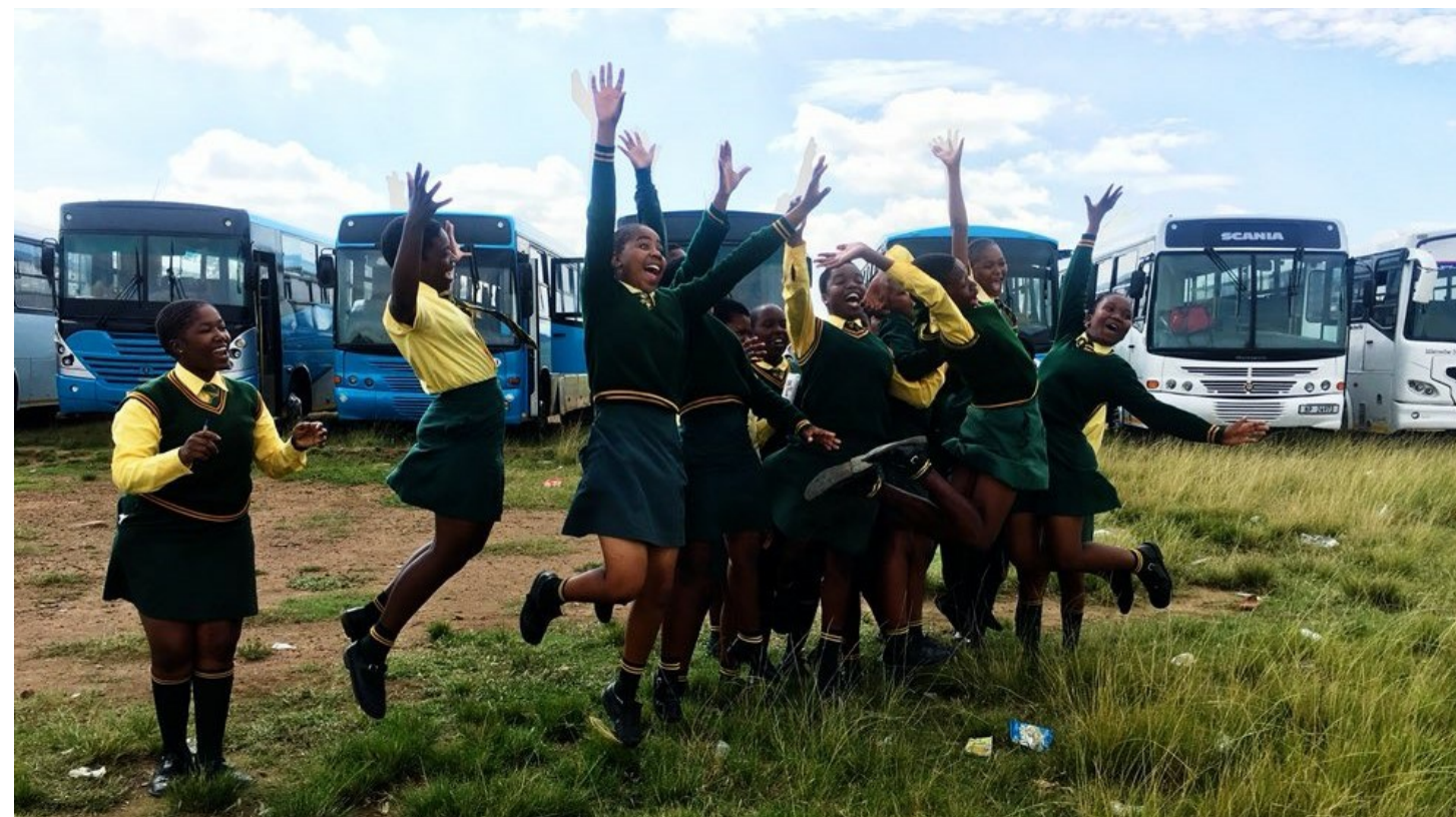
Above: Learners celebrating after buses and taxis arrive at their school.

In a significant victory for KZN Equal Education members, buses and taxis were delivered to 12 schools in Nquthu in KZN on 10 April 2018. This follows a court order in the Pietermaritzberg High Court last year, after a challenge was brought by Equal Education against the inadequate transport provisioning in Nquthu and the province.